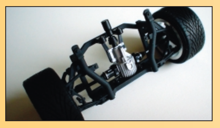
4 Here is the rear suspension. Brilliant Tamiya engineering recreates the real thing perfectly! I wish the drive shaft was a whole piece, though! I applied some Bare-Metal Foil to simulate boot clamps.