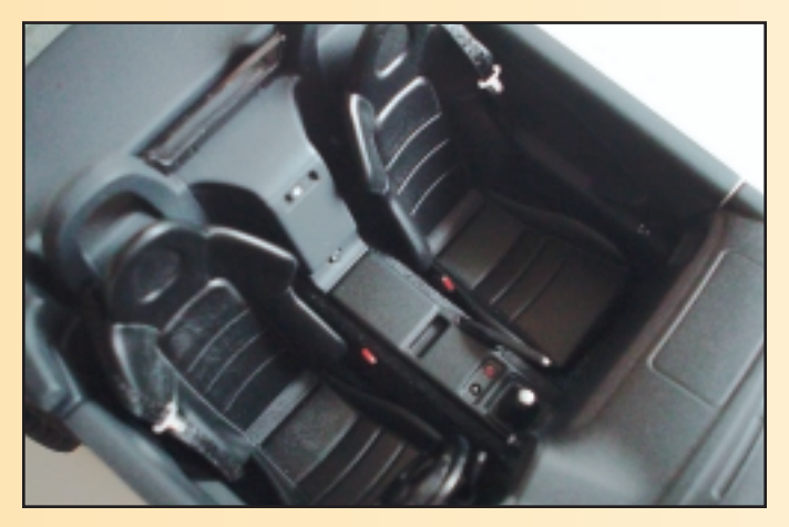
14 I scratchbuilt seatbelts latches from sheet styrene and flexible vinyl, painted them black, and glued them to the seats. I also painted the release buttons red. They add to the realism of the interior, and this is very important for the model that will be displayed with its top off!

1 2 This is interior before final seat installation. I used 1/32" Hobby Lobby ribbon and Detail Master buckles to make seatbelts and super glued them both to the retainers and the seats. Seats were painted semi-gloss black and black-washed to look like they were made from real leather.