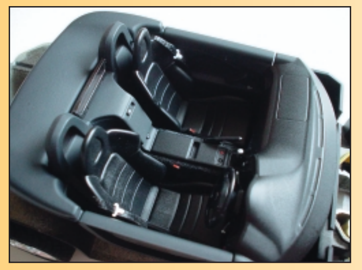
16 This is a picture of a completed interior tub with everything installed. You can also see the rear window installed.