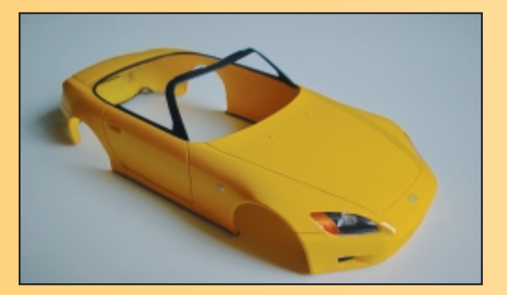
B Painted, polished, and waxed body with installed headlights, painted window frames and applied front emblem. Couldn't wait to see how it looks with this emblem on!