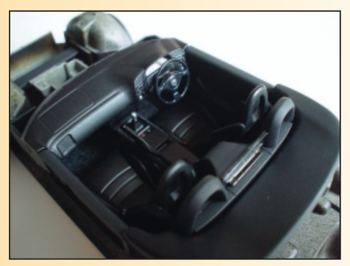
T Another picture of completed interior. This is the way it will be seen when displayed. I didn't glue the dashboard in case I want to switch it for the RHD one.

18 Final assembly. Soft top, antenna, mirrors, metal transfers, rim decals, turn signals — presto! The assembled model looks amazingly accurate and true to the original. The kit like that is why Tamiya is one of the top manufacturers of plastic models.